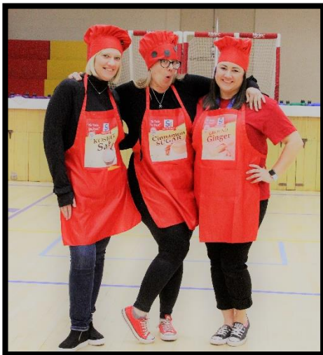
Our own Spice Girls!

Our Arizona weather is incredible; however, mornings at Hassayampa can be chilly! Please make sure you send your child in clothes that fit the temperature. Layered clothing is ideal. It is recommended that student names are added to the clothing tags.